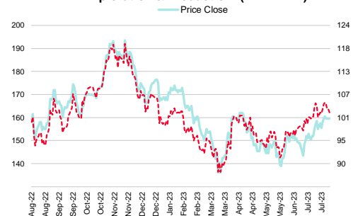
PTT Exploration & Production (PTTEP TB)